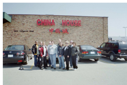
Attendees of first meeting outside the China House Buffet in DeKalb, IL.

"The Chapter needs 10 full members or 7 full members and 3 support members to constitute an active charter."